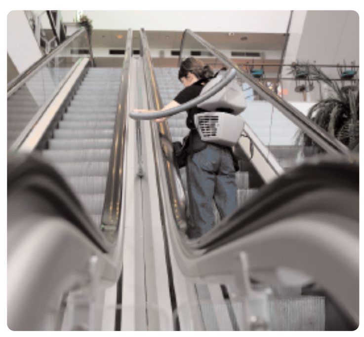
The battery version gives the operator total freedom and the possibility to clean hard-to-navigate areas