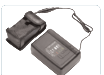
Batteries can be changed in seconds for maximum productivity